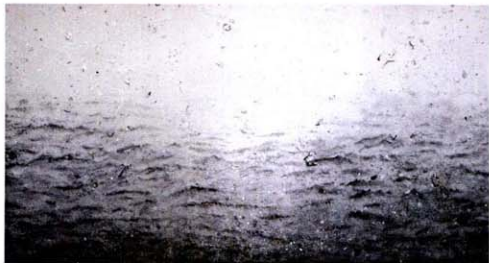
大海 No.1 2014