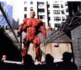
我的纽约 2002 My New York 2002