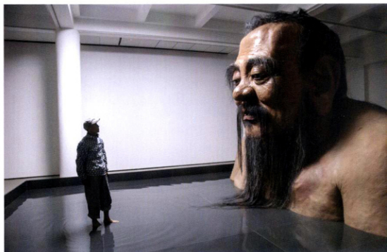
问孔子 No.2 2011 Question Confucius No.2 2011